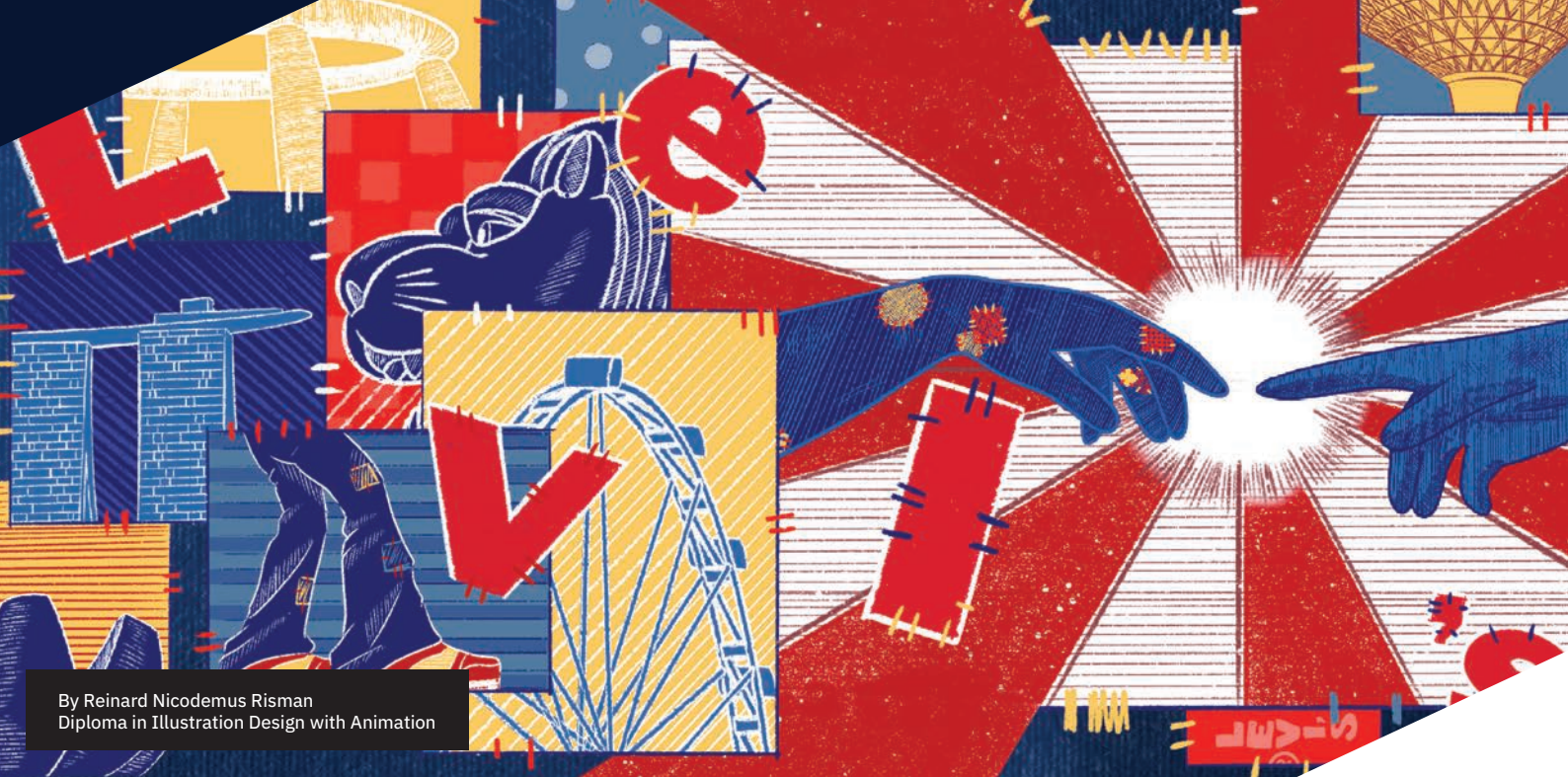
By Reinard Nicodemus Risman Diploma in Illustration Design with Animation