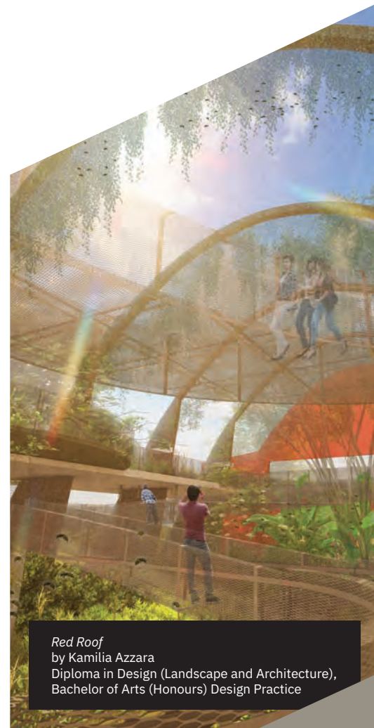
Red Roof by Kamilia Azzara Diploma in Design (Landscape and Architecture), Bachelor of Arts (Honours) Design Practice