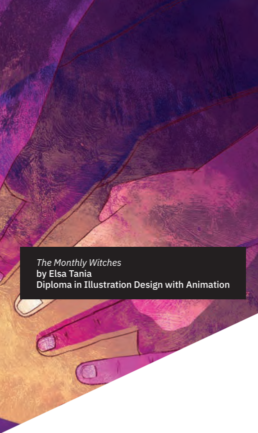
The Monthly Witches by Elsa Tania Diploma in Illustration Design with Animation