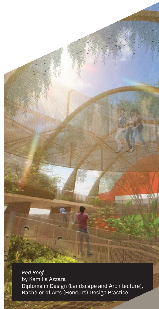
Red Roof by Kamilia Azzara Diploma in Design (Landscape and Architecture), Bachelor of Arts (Honours) Design Practice